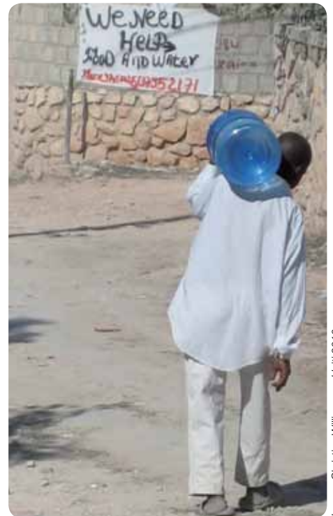
Haiti 2010

While applauding all of the above, it is important to recognise that the staff support field still faces challenges. Knowledge, previously a significant