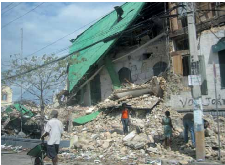
Haiti 2010

The challenge for the future is this: INGOs must make a commitment to adopt and implement recognised staff support best practices . The ongoing reluctance and, in some cases, refusal to provide such services to staff is regrettable, if not deplorable. Comparable organisations such as the military, law enforcement, emergency response personnel, and even corporate entities routinely ensure staff support processes are integrated into institutional structures. Yet many INGOs provide, in practice, virtually no organisational resources to protect staff from the ongoing, complex and dangerous challenges of international humanitarian work.