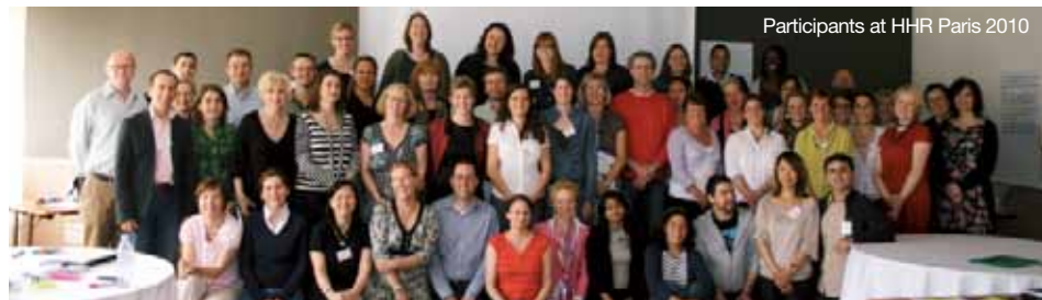
Participants at HHR Paris 2010

Our Humanitarian HR conferences on Talent Management: Effective strategies for managing and developing your workforce took place just outside Paris, France and in Mombasa, Kenya in May, with just under one hundred participants in total between the two.